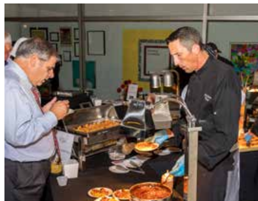
Nearly 300 guests strolled through the Gala to sample all 10 culinary competition dishes and cast a People's Choice vote for their favorite.

Des Moines Central Campus ProStart students assisted the chefs in preparing, plating and serving their dishes to hungry guests at the Grand Tasting Gala.